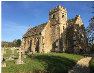
St Peter's Little Rissington