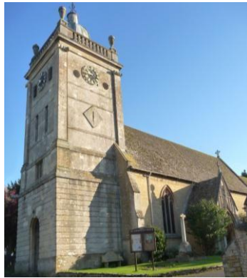
St Lawrence Bourton on the Water