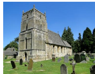
St Lawrence Wyck Rissington