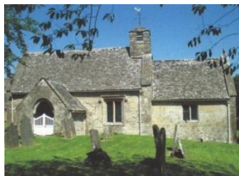
St James' Clapton on the Hill