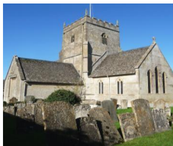
St John the Baptist Great Rissington