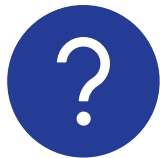
Diocesan Director of Education