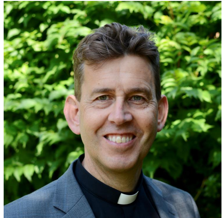
The Revd Canon Nigel Genders, Chief Education Officer, Church of England

It is with that national perspective that I am writing to encourage you as you consider applying for this role. The current educational landscape continues to see a huge amount of change, and whilst that always brings challenges it also presents an opportunity to be strategic and innovative in shaping the diocese's engagement with the school system in a way that secures the high-quality education for which our schools are renowned, for generations to come.