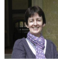
The Archdeacon of Gloucester The Ven Hilary Dawson